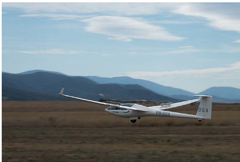
Figure 2: VH-DGA