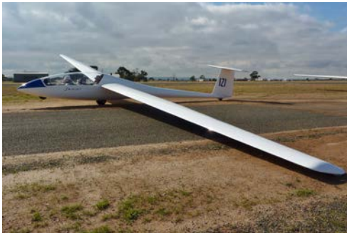
Figure 1: VH-IZI and VH-KXS

At about the same time, the pilot of a McDonnell Douglas 500N helicopter, registered VH-KXS (KXS), was conducting circuits (Figure 1). He was on his fifth circuit and had reported broadcasting on the common traffic advisory frequency (CTAF) immediately prior to turning base for runway 19. 1